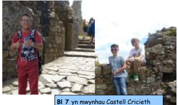
BI 7 yn mwynhau Castell Cricieth