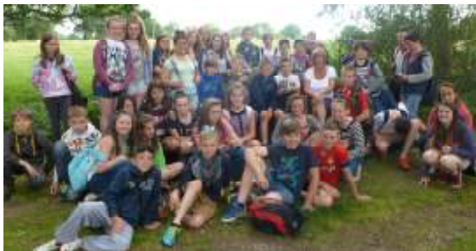
Yr 7 Lon Goed

Year 10 : First Aid Workshop; Walking up Tre'r Ceiri and down to Nant Gwrtheyrn; an overnight visit to Bangor University & Team Challenges.