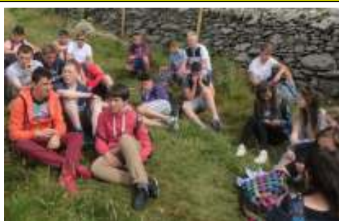
Yr 10 relaxing and enjoying the views of Tre Ceiri & Nant Gwrtheyrn.