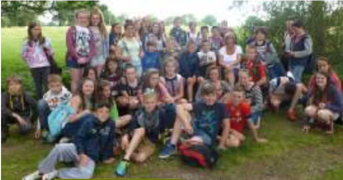
BI7 yn Lon Goed

Blwyddyn 10 : Gweithdai cymorth cyntaf, taith gerdded i Dre'r Ceiri a Nant Gwrtheyrn, ymweliad â Phrifysgol Bangor & gweithdy Her Timau.